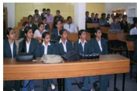
During Result declaration and analysis of online examination round