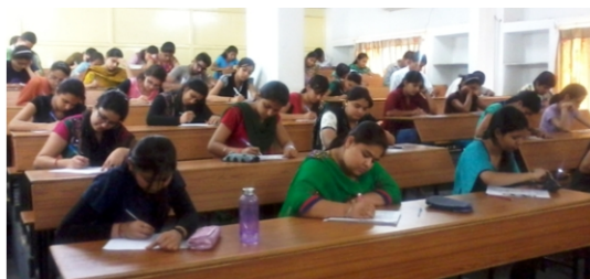
Participants during the debugging contest

errors by dry running the programs, understand nature and type of error and debugging skills.