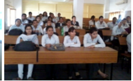
Students during presentation Competition