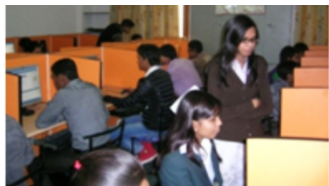
Students during Online examination