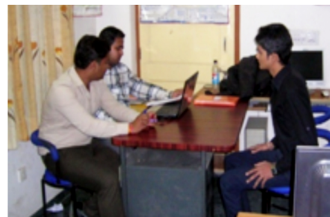
During Personal interview