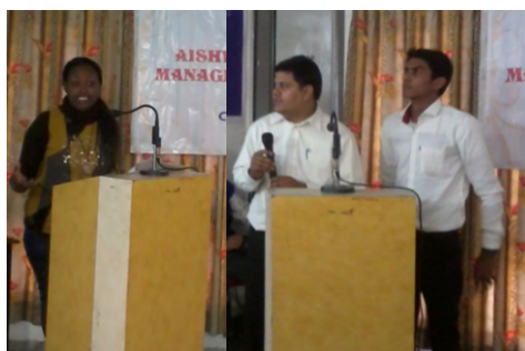
Participants Presenting during the Competition