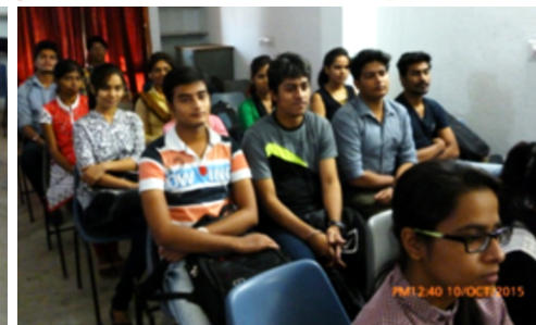
Audience witnessing the Chief Guest's address