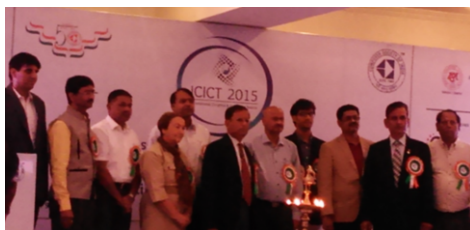
Dignitaries after lighting the lamps inaugurating the International Congress on ICT 2015

09-10-2015 : International Congress on Information and Communication Technology - ICICT 2015 concurrent with National Excellence Awards 2015 was organized by Computer Society of India (CSI) Udaipur Chapter, associated with Association of Computer Machinery (ACM), Agriculture Engineering Division,