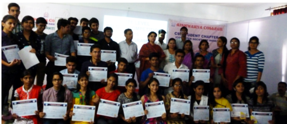
Moments of Achievement